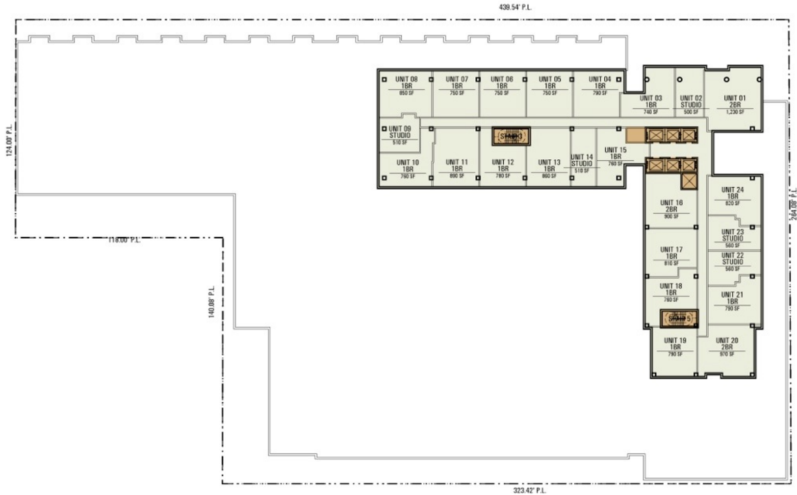
2 South Building Typical Residential Floor Scale: 1" = 20'