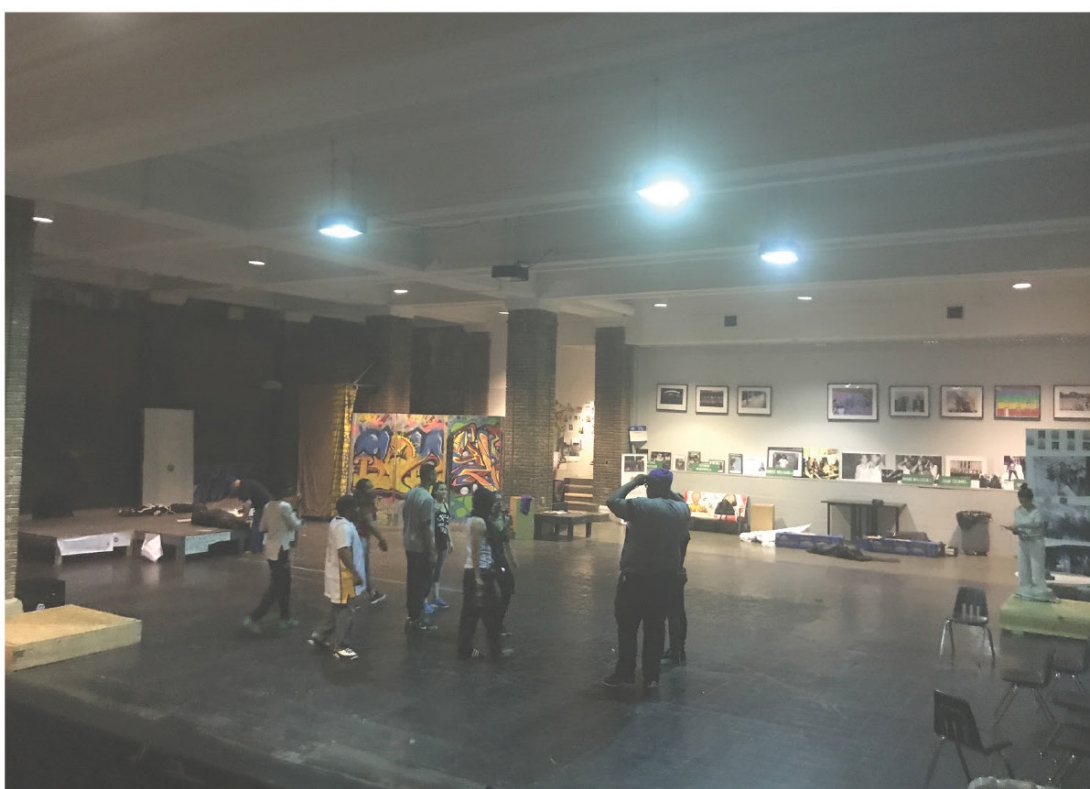
EXISTING MULTI-PURPOSE ROOM