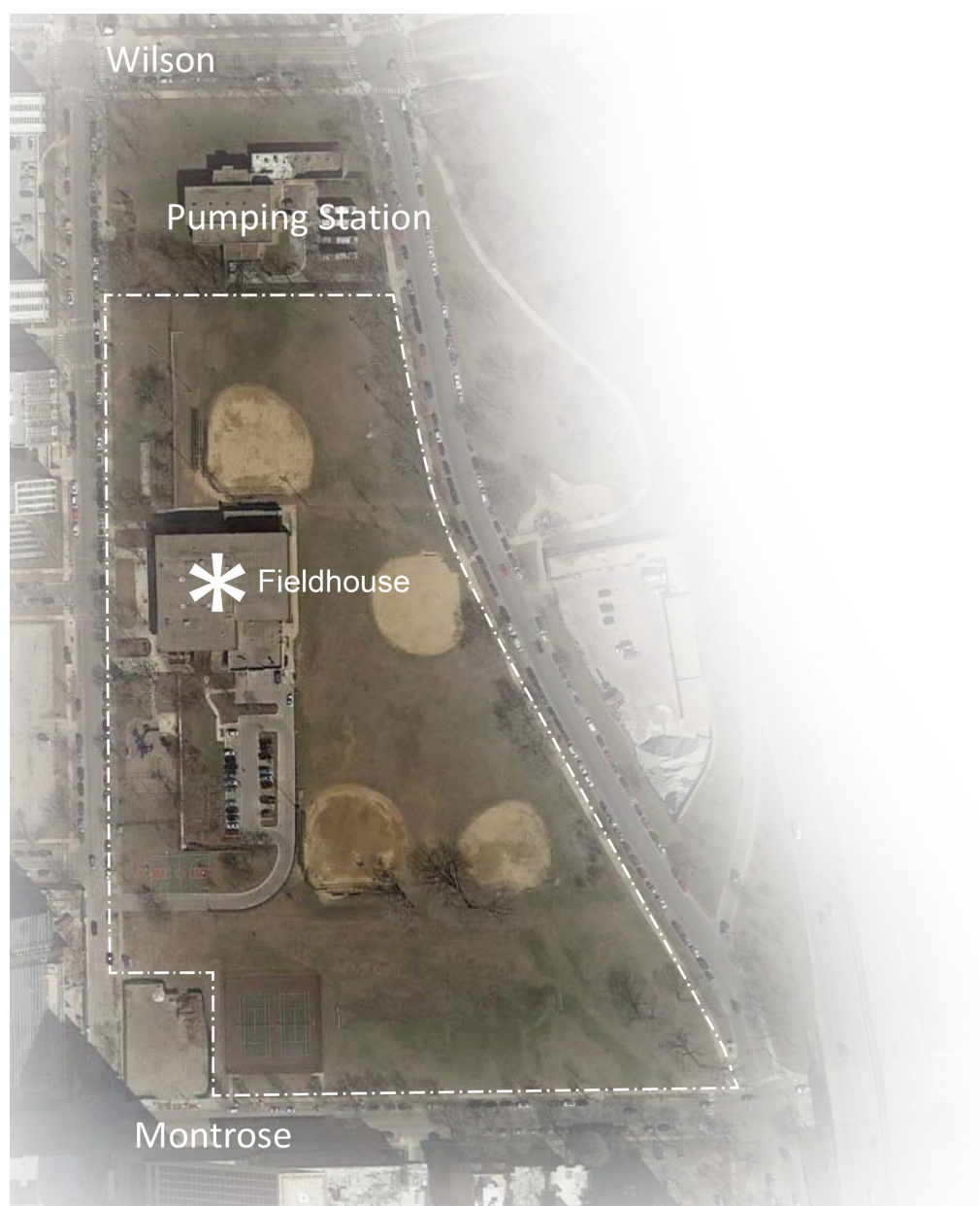
⊕ SITE DIAGRAM