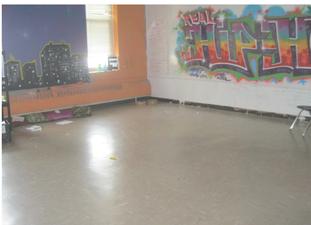
EXISTING MEETING ROOM