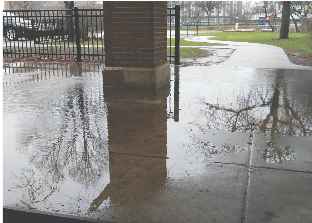
EXISTING FLOODED BUILDING ENTRY