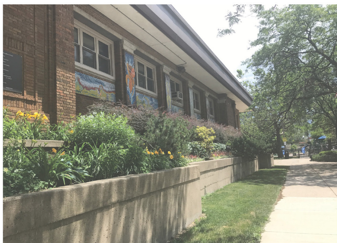
EXISTING LEAKING PLANTER