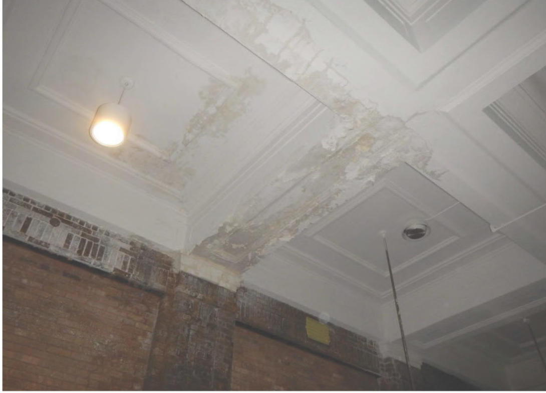
EXISTING MULTI-PURPOSE ROOM WATER DAMAGE