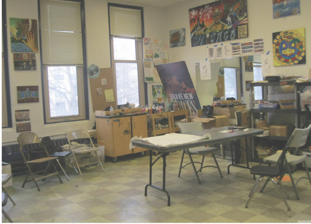
EXISTING MEETING ROOM