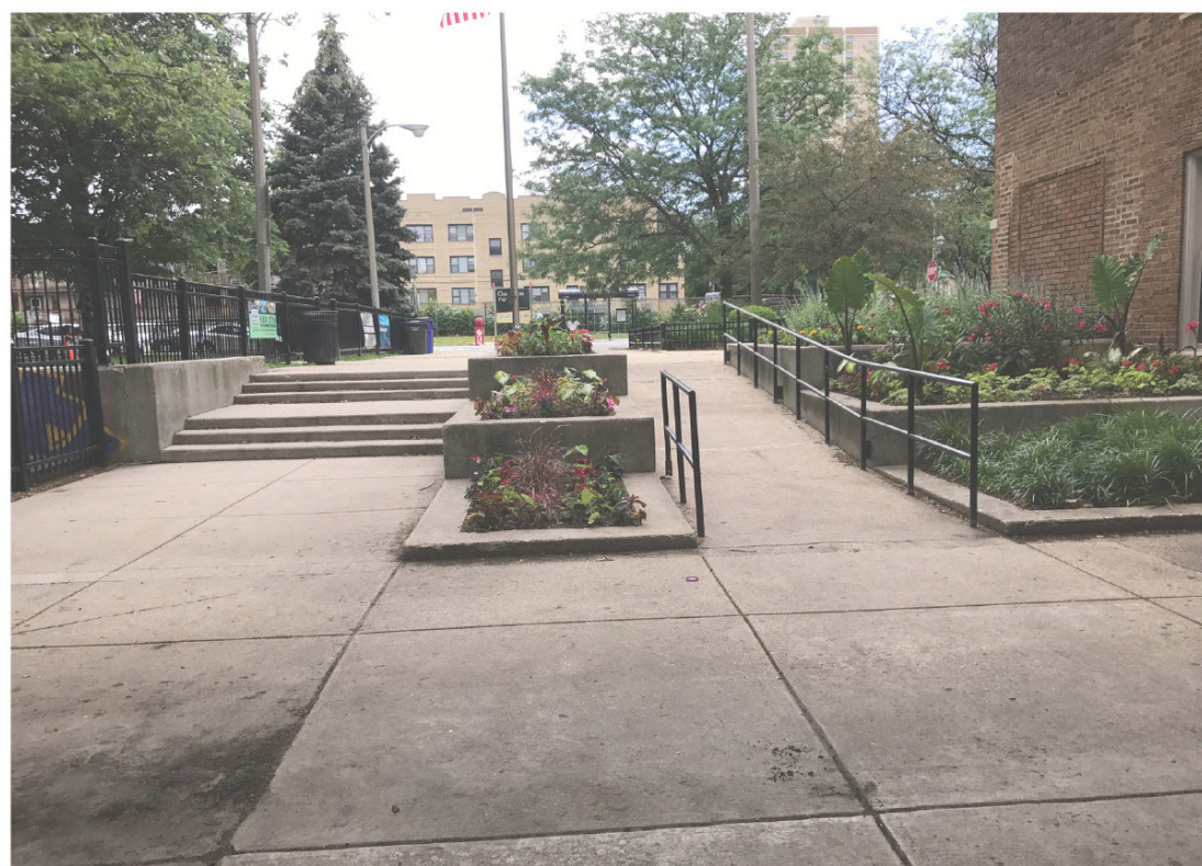
EXISTING BUILDING ENTRY