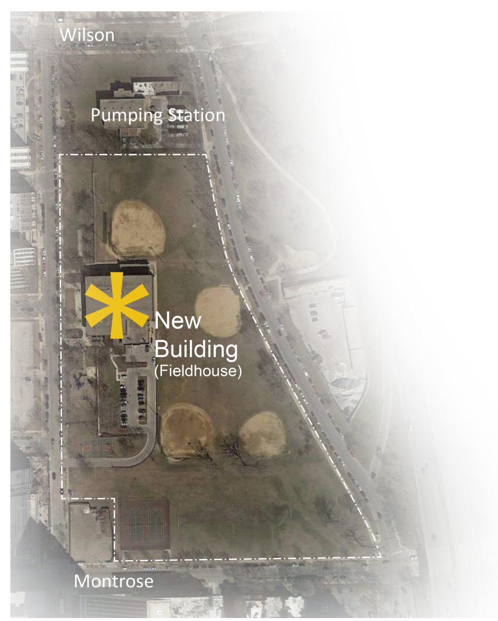
⊕ SITE DIAGRAM