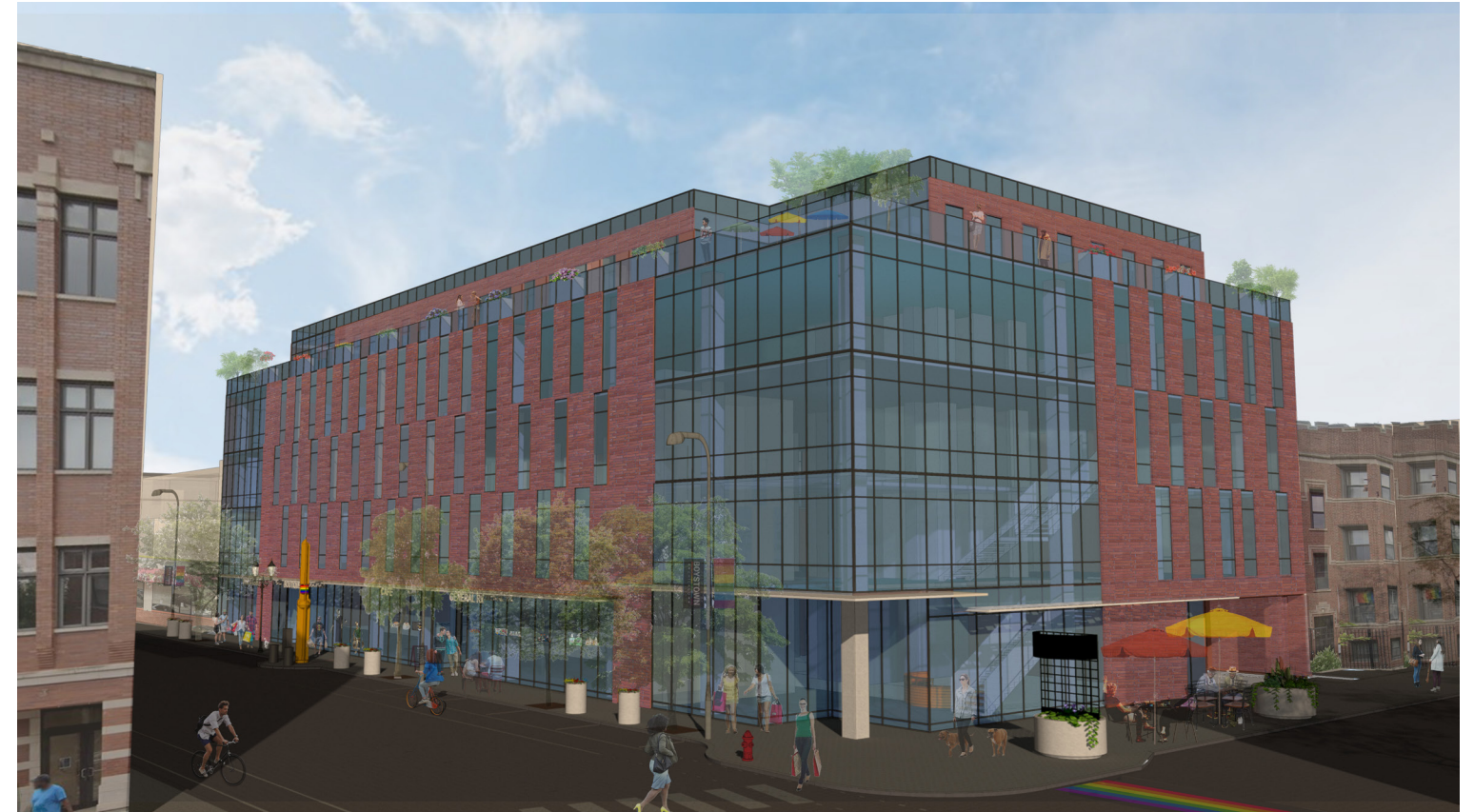
REVISED BUILDING PROPOSAL AUG. 20, 2020