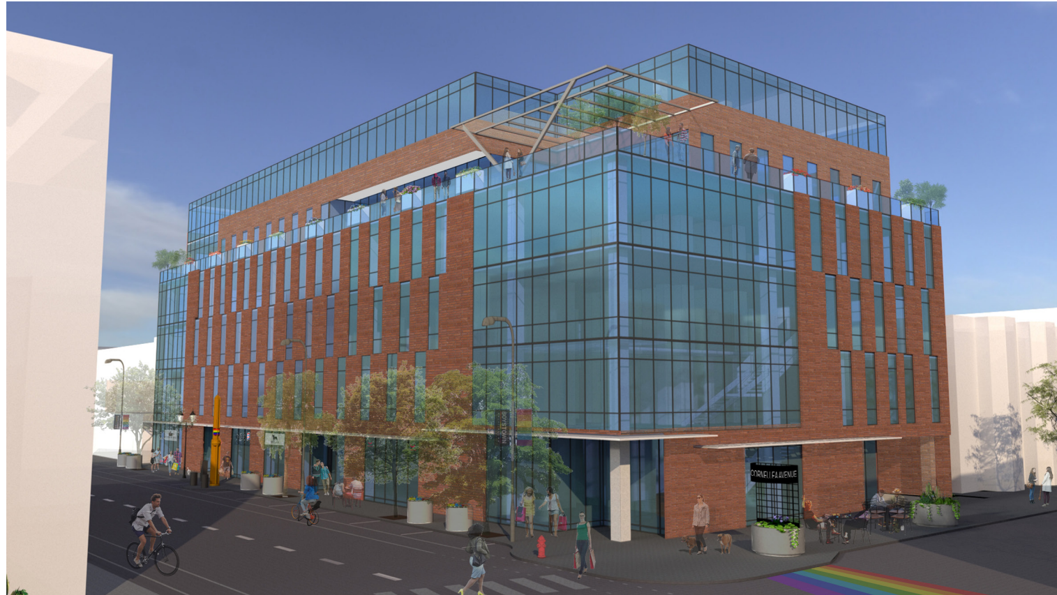
ORIGINAL PROPOSAL MAR. 11, 2020