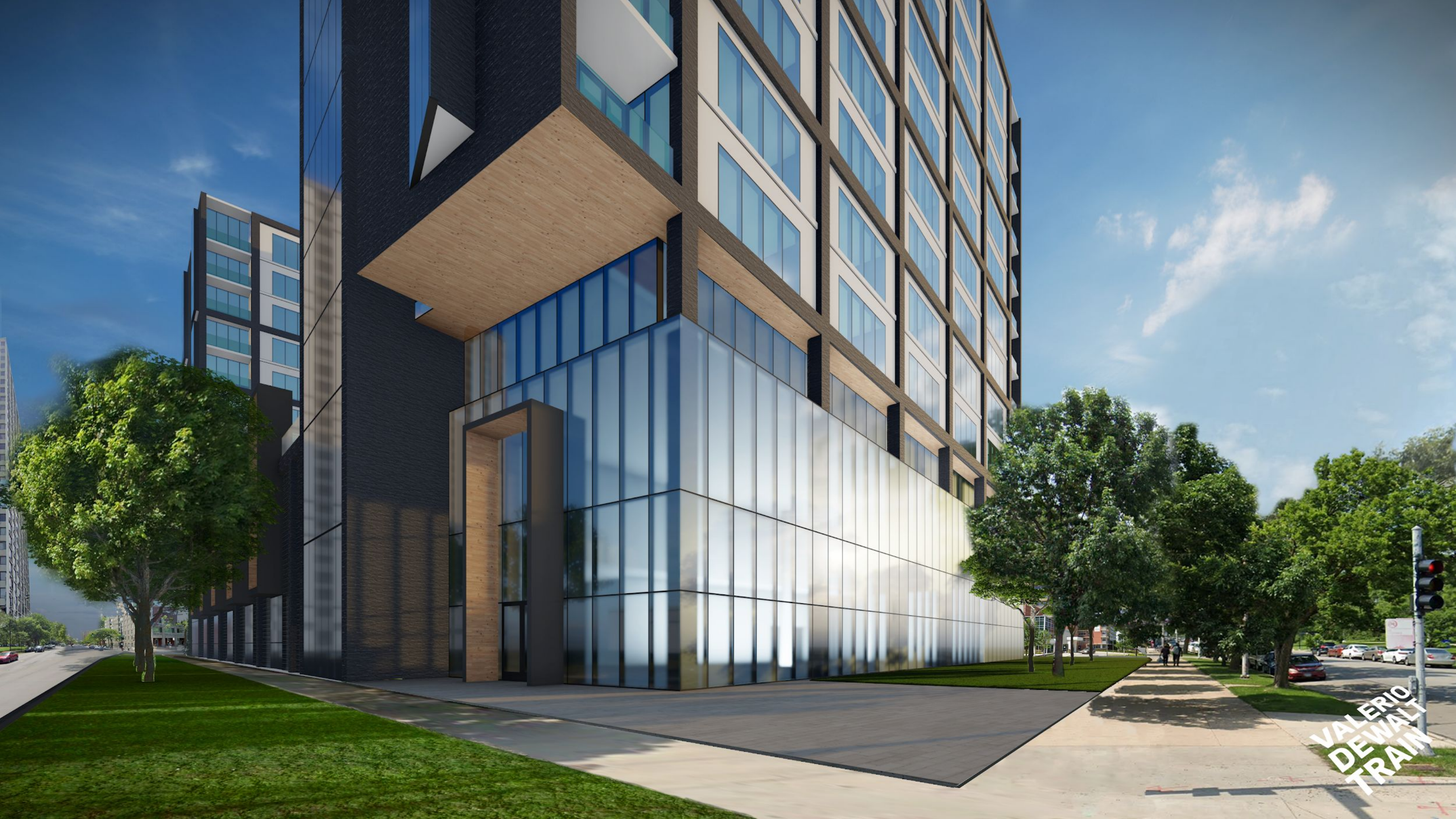
Concept Sketch Marine & Wilson looking northwest, building entry