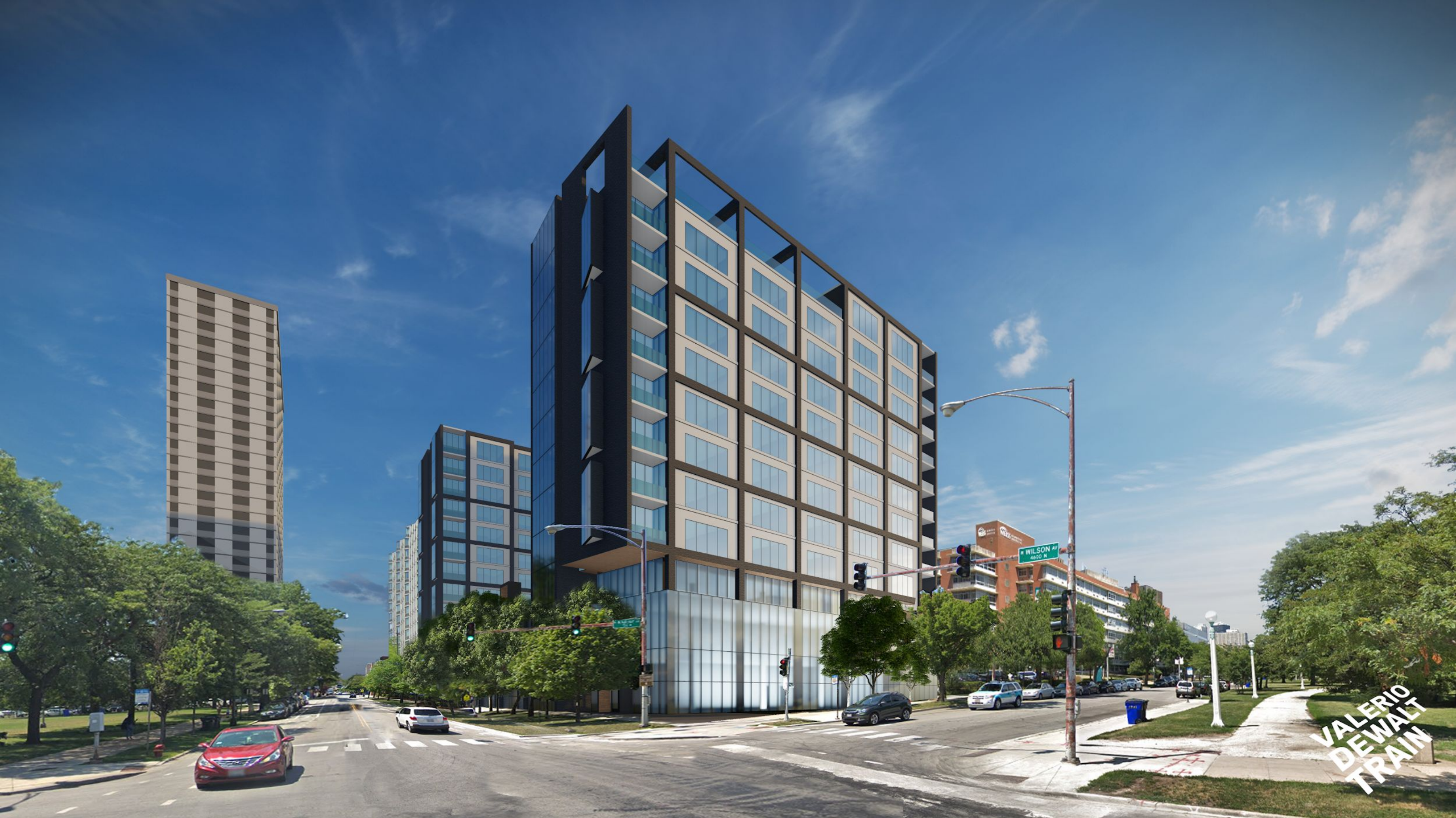
Concept Sketch Marine & Wilson looking northwest