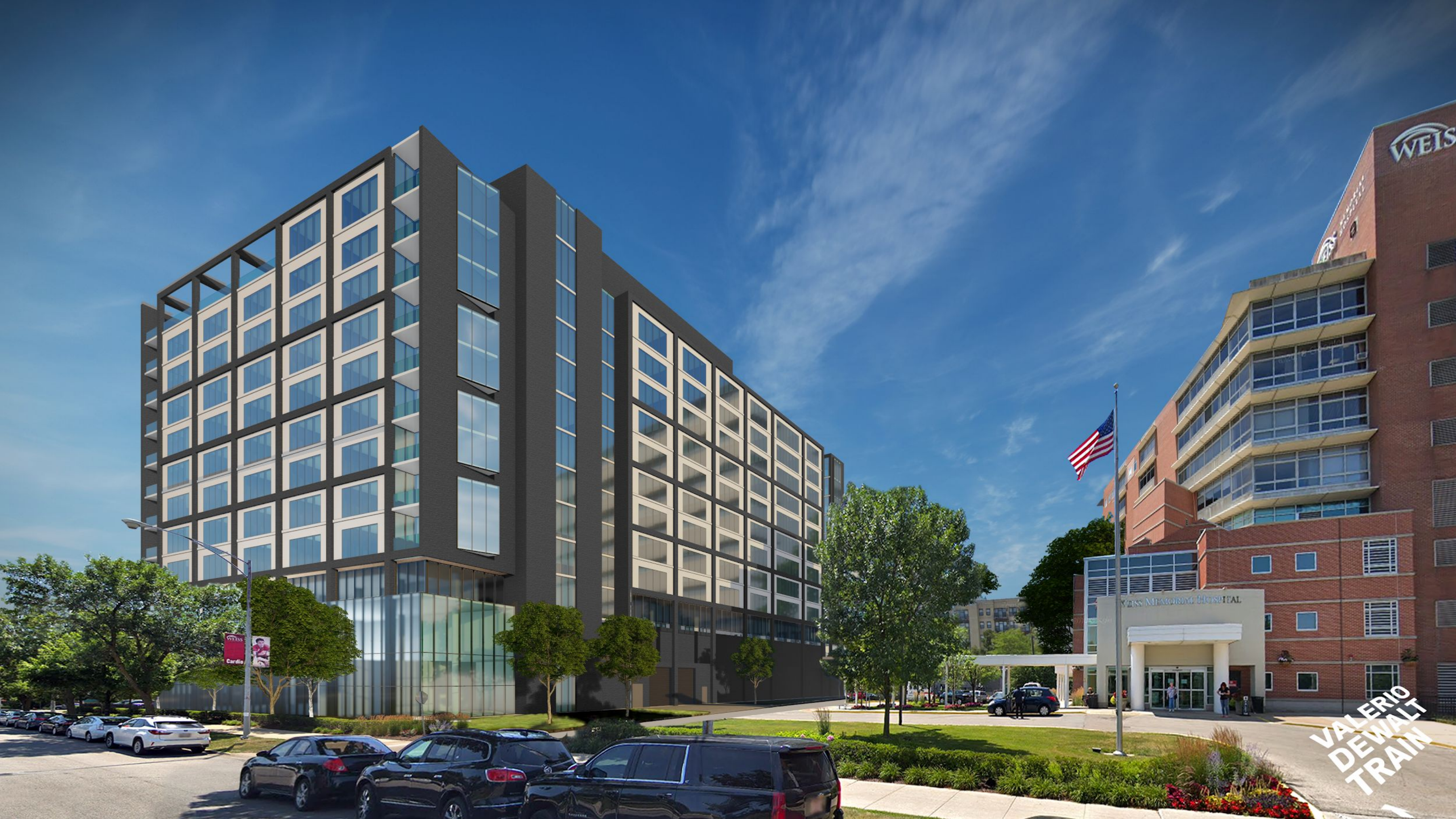
Concept Sketch Marine & Weiss Hospital looking southwest