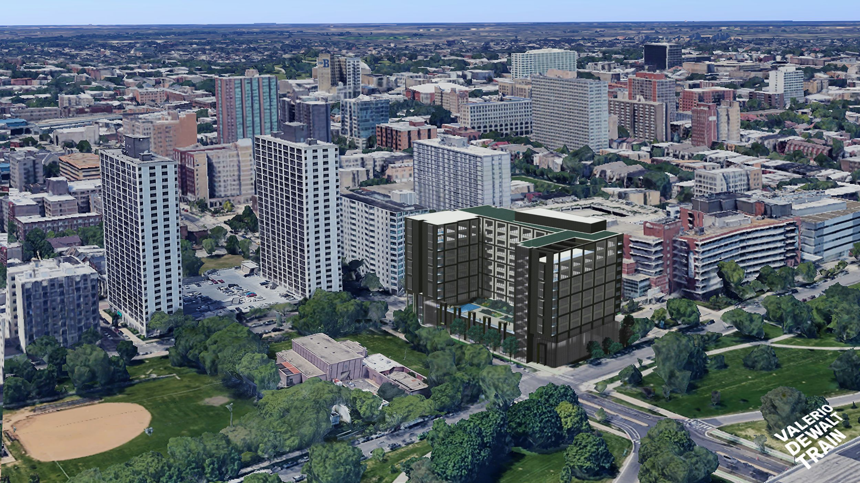
Concept Sketch Marine & Wilson aerial view